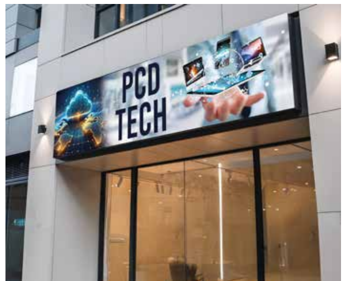
Shop Fascia Signage