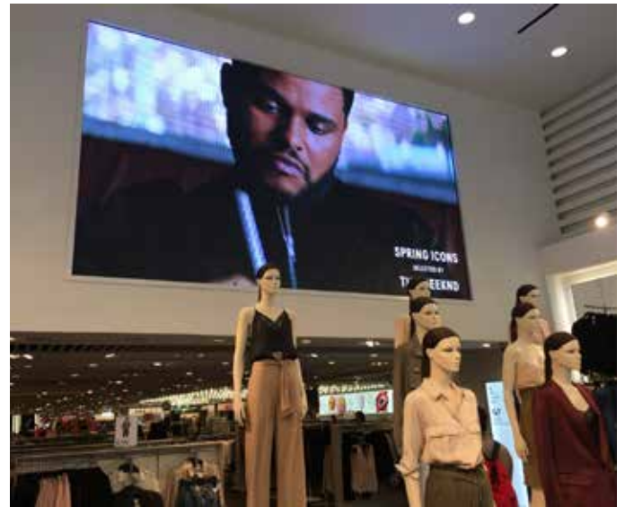
Large Indoor Screens