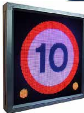
96 x 96 pixels