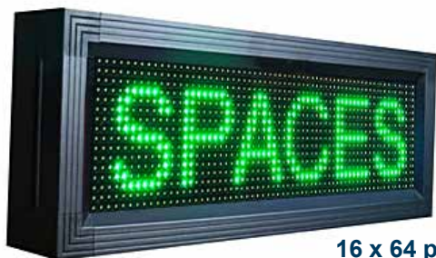
16 x 64 pixels