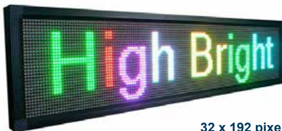
32 x 192 pixels