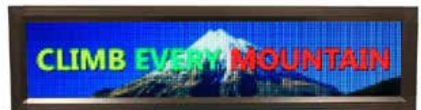
32 x 160 pixels