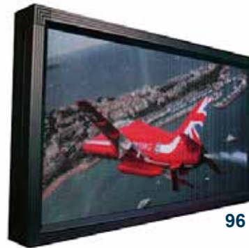
96 x 192 pixels