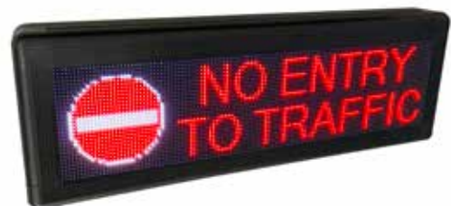
32 x 128 pixels