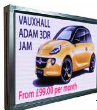
128 x 192 pixels