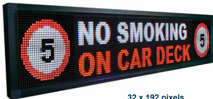
32 x 192 pixels