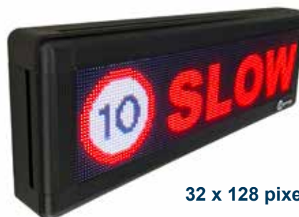
32 x 128 pixels