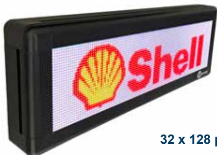
32 x 128 pixels