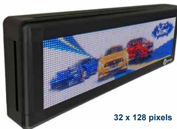
32 x 128 pixels