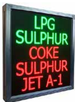
128 x 128 pixels