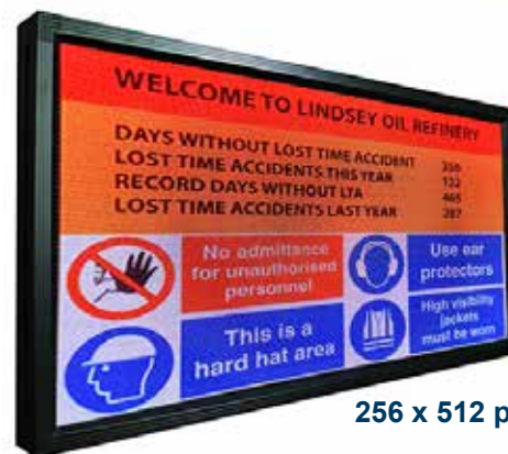
256 x 512 pixels