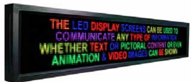
32 x 224 pixels