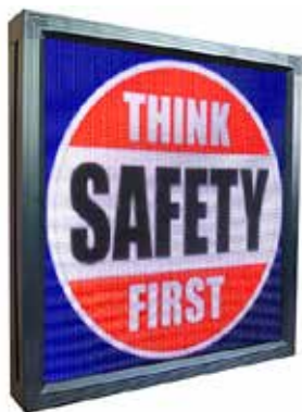
192 x 192 pixels