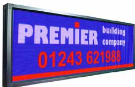
64 x 256 pixels