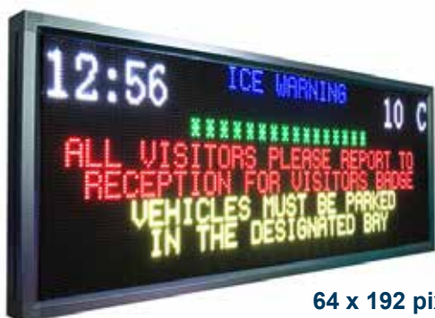
64 x 192 pixels