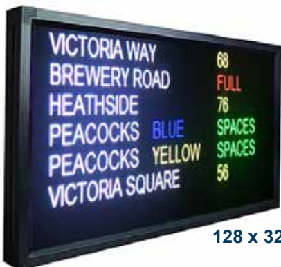
128 x 320 pixels