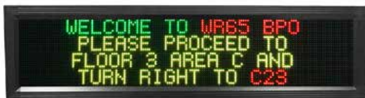
32 x 160 pixels