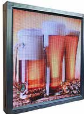
128 x 128 pixels