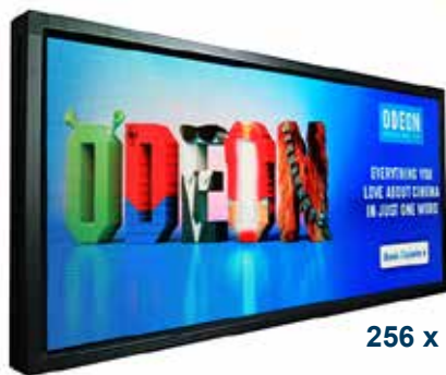
256 x 640 pixels