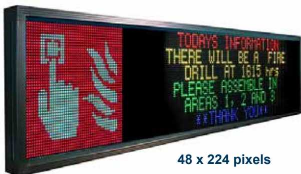
48 x 224 pixels