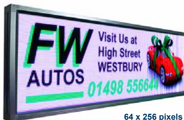
64 x 256 pixels