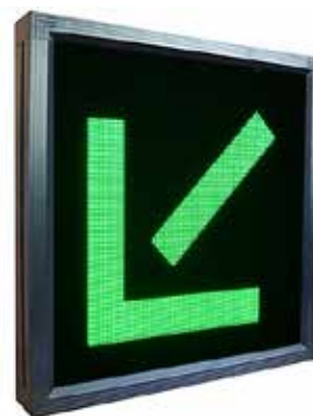
96 x 96 pixels