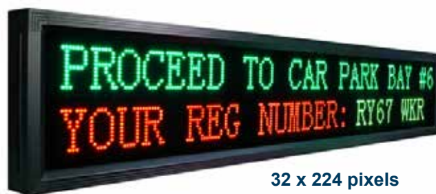
32 x 224 pixels