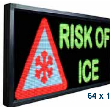
64 x 128 pixels