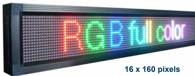
16 x 160 pixels