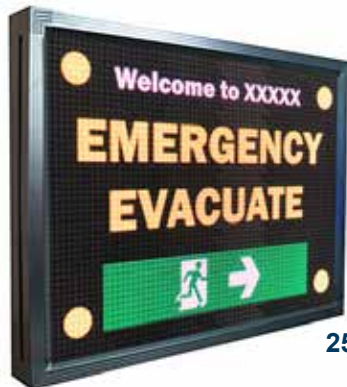
256 x 320 pixels