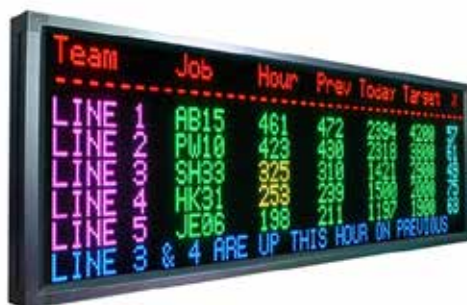
64 x 256 pixels