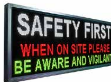
64 x 224 pixels