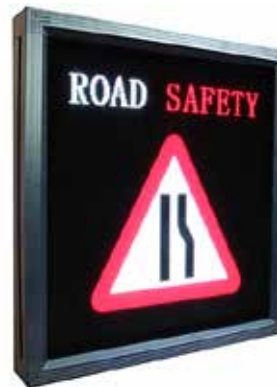
192 x 192 pixels