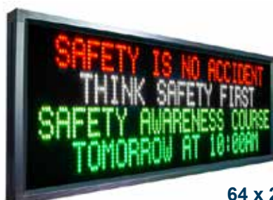
64 x 224 pixels