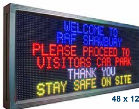
48 x 128 pixels