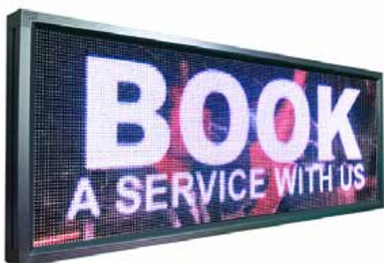
64 x 192 pixels