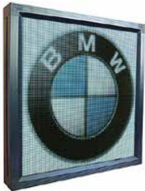
96 x 96 pixels