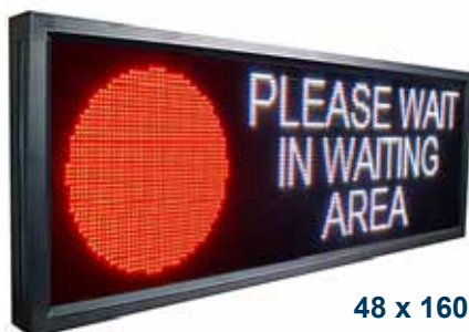
48 x 160 pixels