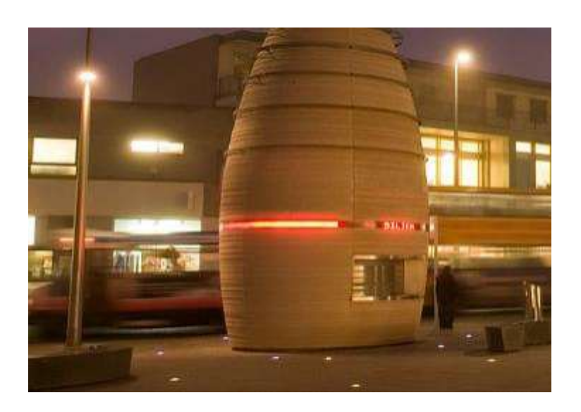
Above: 60mm character height continuous single line display around a ticket booth in Western Supermare.

Above Left: 7 line weekly event display for The Limelight Club. Display based on MS16/100-7L