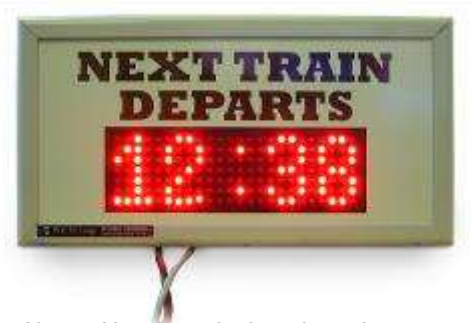
Above: Novelty train time departing clock at Longleat Park. 80mm ch ht