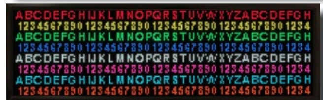
Display shown 224 x 64 pixel resolution