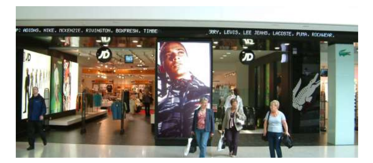
Photo left: Entrance way to high street store. Display will show special offers or brand names in a continuous stream and the video board shows adverts.