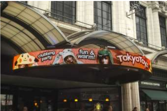
Photo left and below left: Full Colour Video boards at buildings in London give an amazing first impression of the site.

Photos below: External Gate house LED displays showing information to oncoming vehicles.