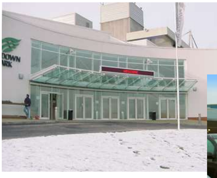
Photo left: single line large external display above glass canopy at the main entrance to Sandown Park Racecourse

Photo below: External video board at motor dealership