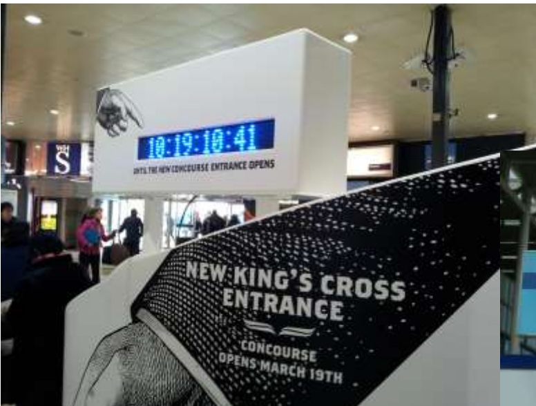
Photo left and below: Countdown Clocks at the entrance to two London stations counting down to their Opening, both using blue LEDs.