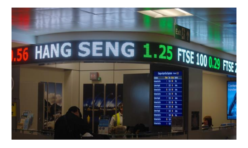
Above: Full colour Ticker at Glasgow airport showing stock market information Left: Stairwell display showing text in a vertical fashion