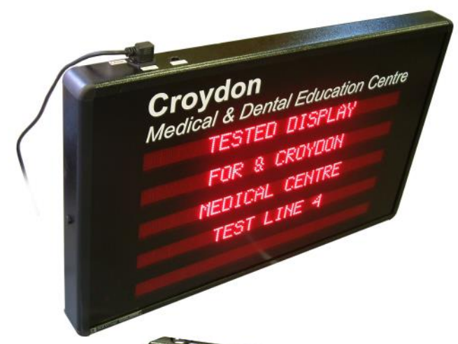
Right: message display used in a training environment to direct students and provide info for each course